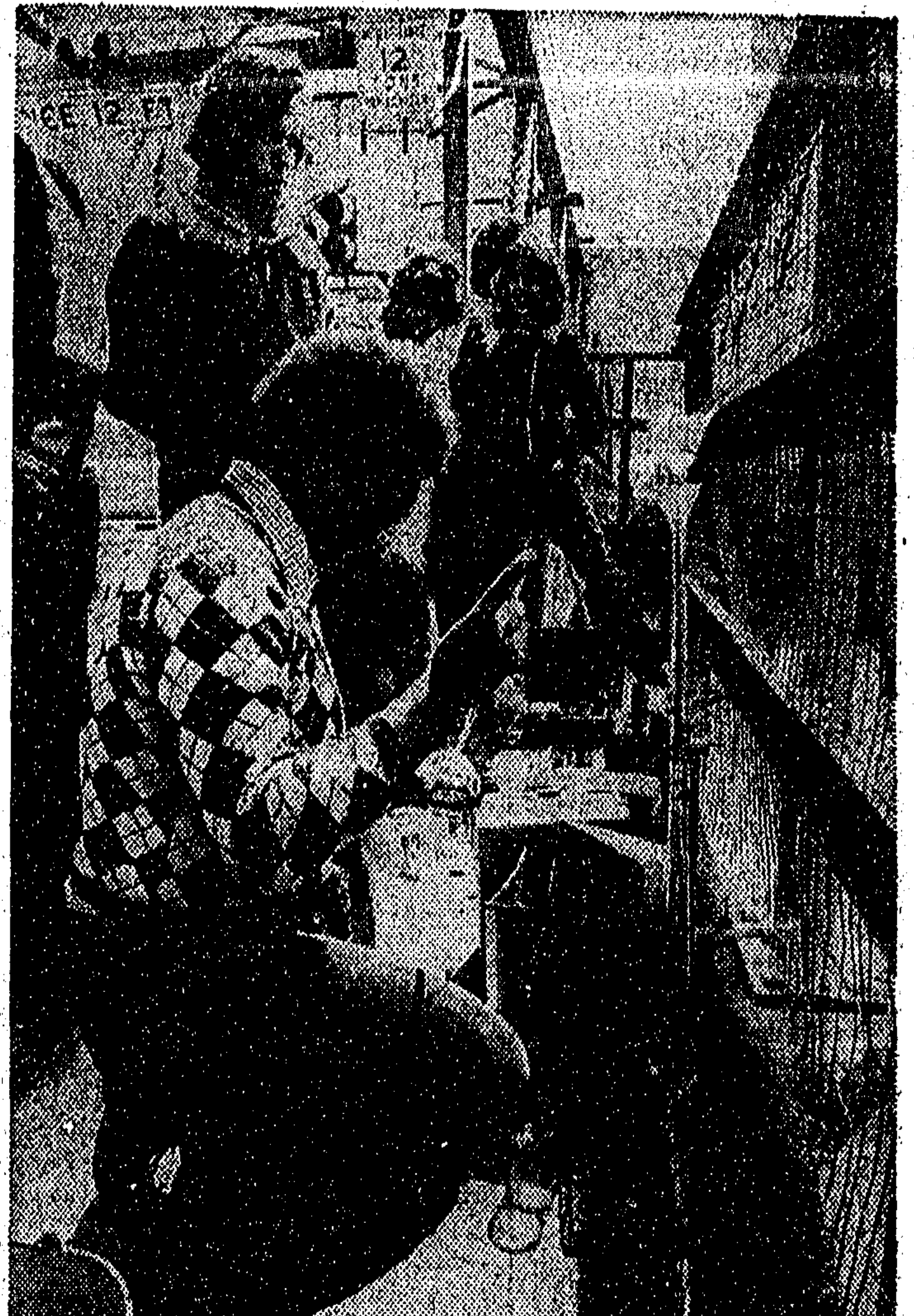
Members of the Marine Biology Club collecting specimens at Coney Island Creek. At left, a student checks a sample of the water for pollution.

Club members showed up at the day-long hearings to bolster their case for stricter regulation of the runoffs. Final regulations are now under consideration.